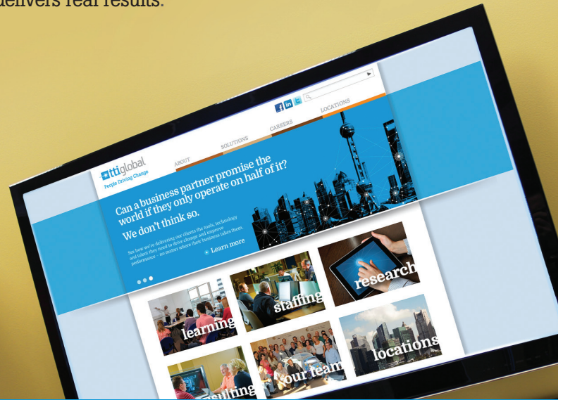
Newly Built and Designed Website

The new TTi Global identity is designed to accurately reflect our innovative attitude; to capture our entrepreneurial spirit; and to be a source of inspiration for positive change that delivers real results.